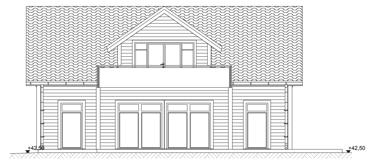
VIEW 3 1:100