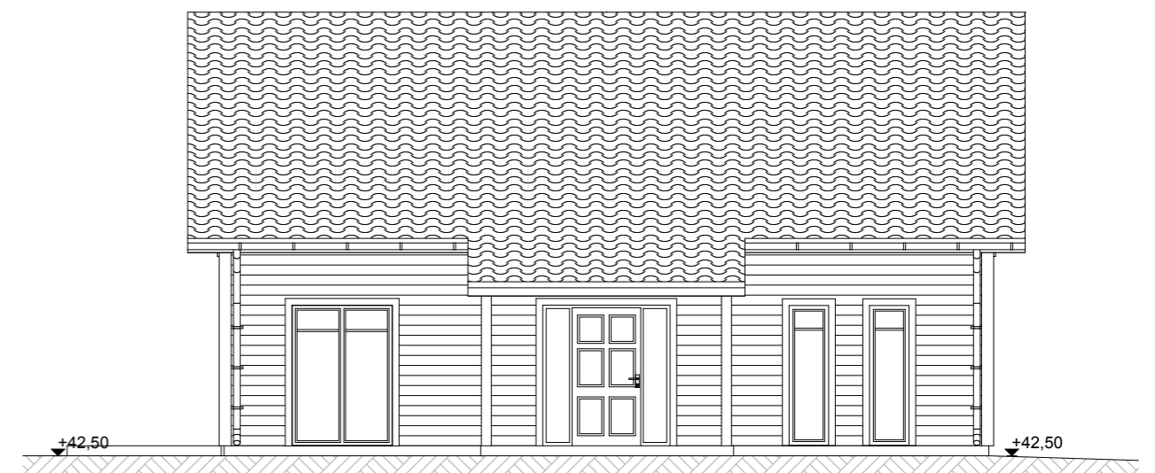
VIEW 1 1:100